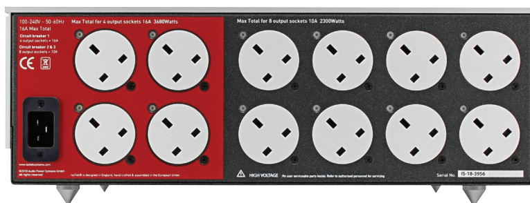
The outlets of the first B block of eight (black), rated at 10A, are intended for source equipment. Amplifiers and other hungry components plug into the A block (red), with four 16A sockets.

A turntable with MC cartridge was deliberately chosen as its tiny output requires a considerable amount of preamplification – the effects of clean power should be